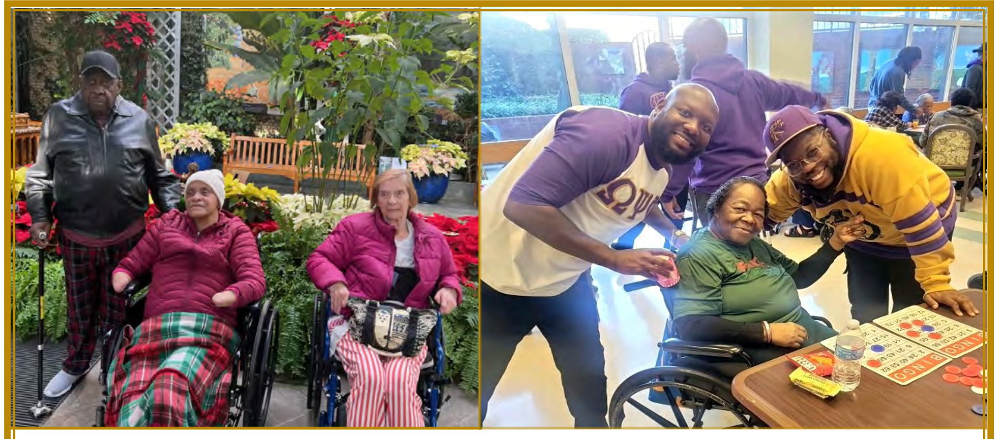
Residents enjoy a trip to the Botanic Garden