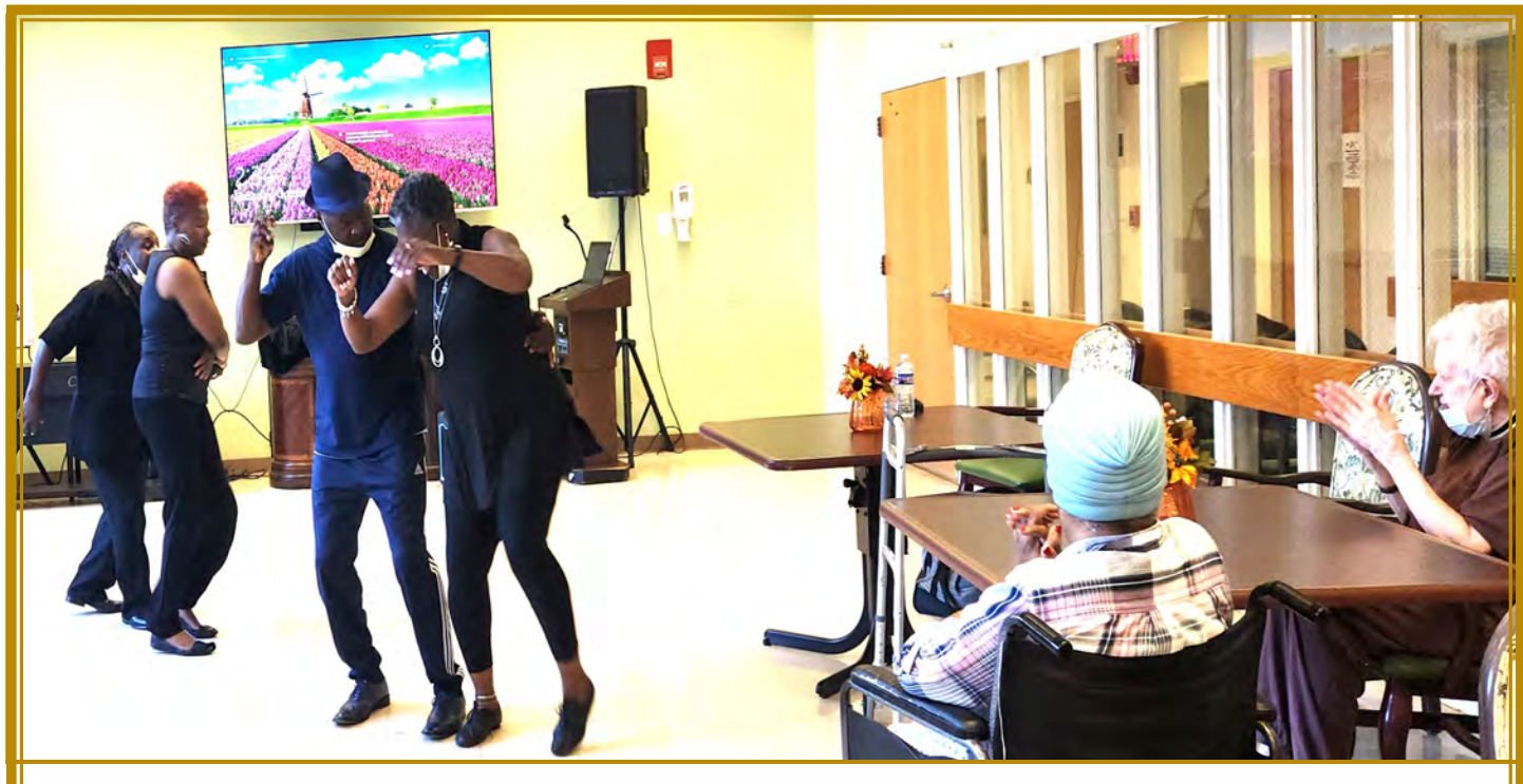
Virginia Ageless Entertainers visit Stoddard to have Dance Time with residents.