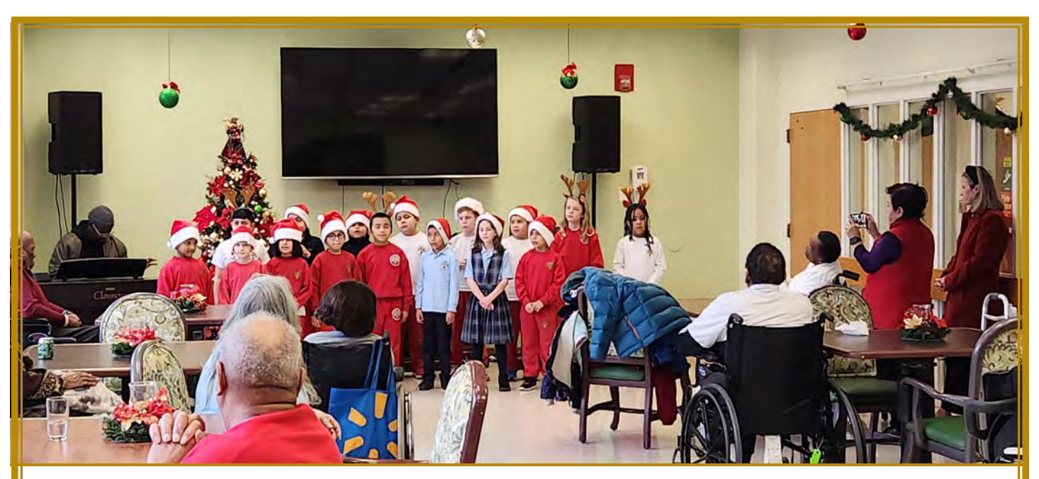
The Sacred Heart Elementary School Students sang Christmas Carols for the residents.