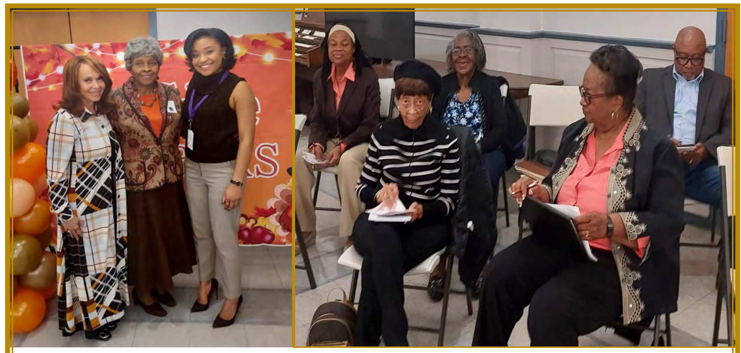
Staff and residents enjoy a Thanksgiving Blessing Luncheon.