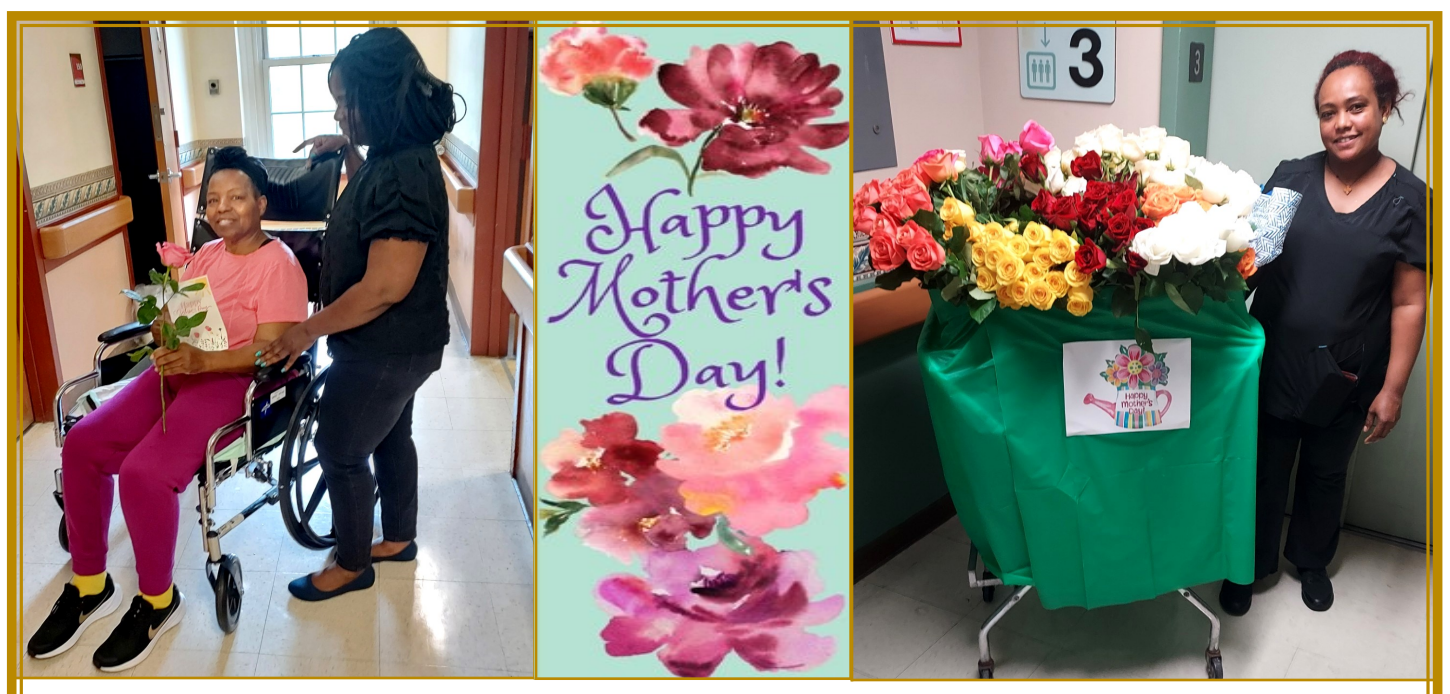
Mothers receive beautiful flowers for "Mothers Day Shout Out"!