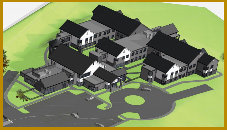
3911 Lottsford Vista Road Mitchellville, MD 20721 (future Assisted Living Facility)