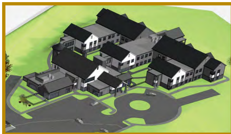
3911 Lottsford Vista Road Mitchellville, MD 20721