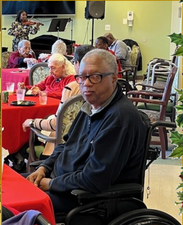
Residents celebrated the Spirit of Joy with a wonderful Christmas Celebration.