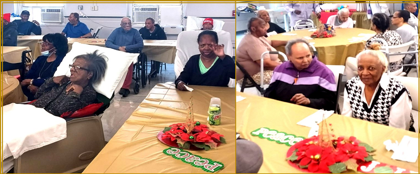
Residents enjoy fun and fellowship at Christmas Party .

Instituting innovative and engaging support services that will help people thrive in their place of community