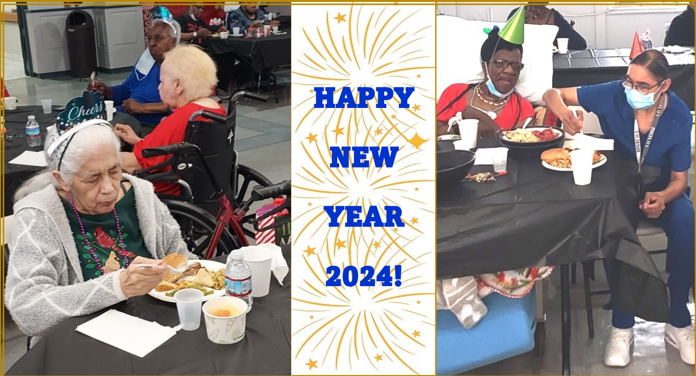
Residents enjoy a New Year's Eve Party to celebrate 2024!