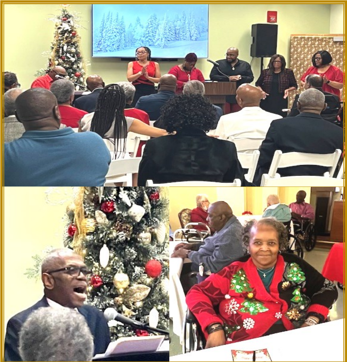
The Annual Holiday Open House and Program is a joyous occasion of fellowship and fine dining.

“To form and sustain safe, viable and caring communities for those in need”. Instituting innovative and engaging support services that will help people thrive in their place of community