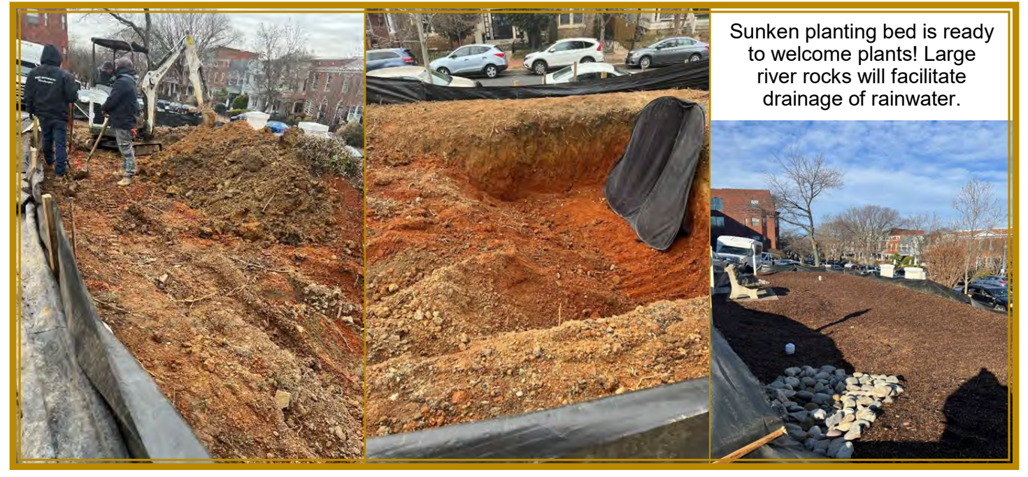
Garden area dug up approximately 10 feet to be replaced with 2 feet of gravel and bioretention soil (mixture of sand and topsoil) to act as a big filter.

Stoddard's partnership with the DOEE and AWS not only helps to reduce stormwater pollution, but also provides many benefits to the Stoddard Community: a beautiful garden with plantings that are native to the Washington, D.C. area and a garden where the community learns about green infrastructure. It will also be open to the nearby schools so students can learn more about our ecosystem. While planning the garden, considerations were also made to select plants that were representative of the era when Stoddard was first built. This project will also potentially meet Stoddard's responsibility to meet the stormwater mitigation requirements of the CRIAC Non-Profit Relief Program.