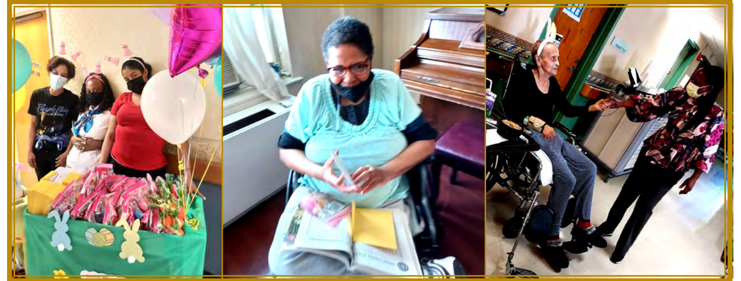
Staff distributed cards and candy to residents as an “Easter Shout Out” .