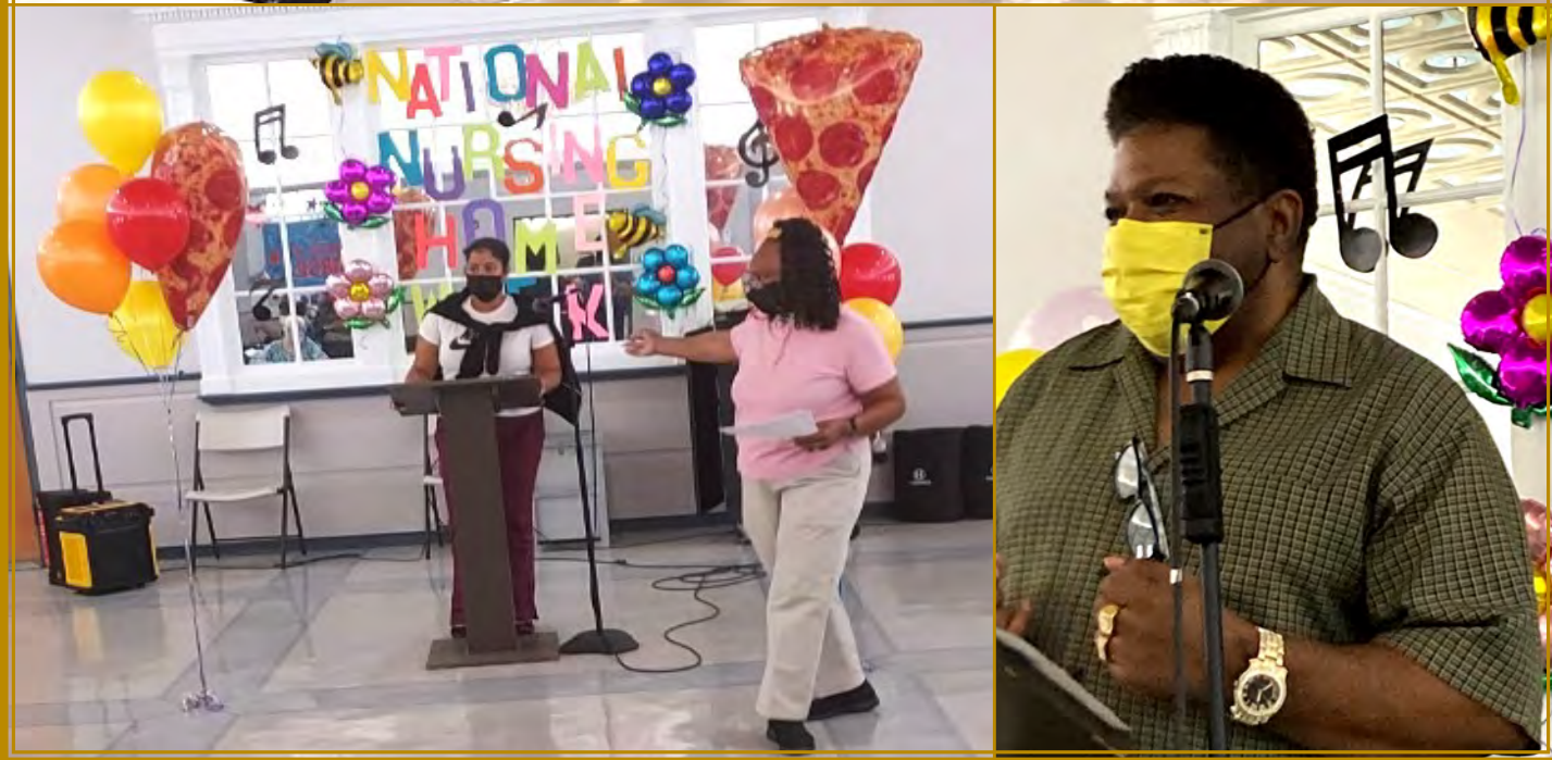
Staff and residents celebrate “National Nursing Home Week” during May 8th -14th.