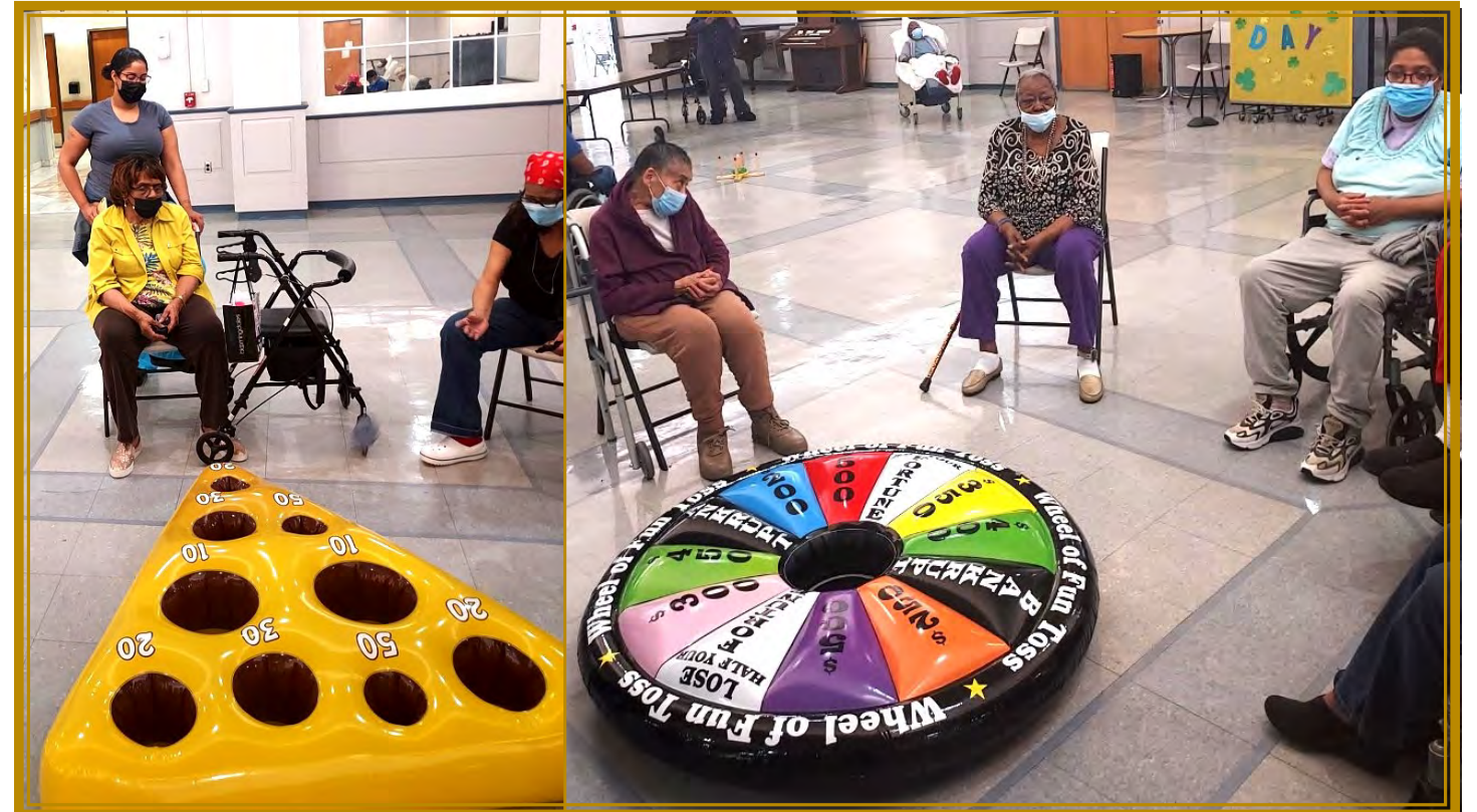
Residents enjoy “Big Game Time” .