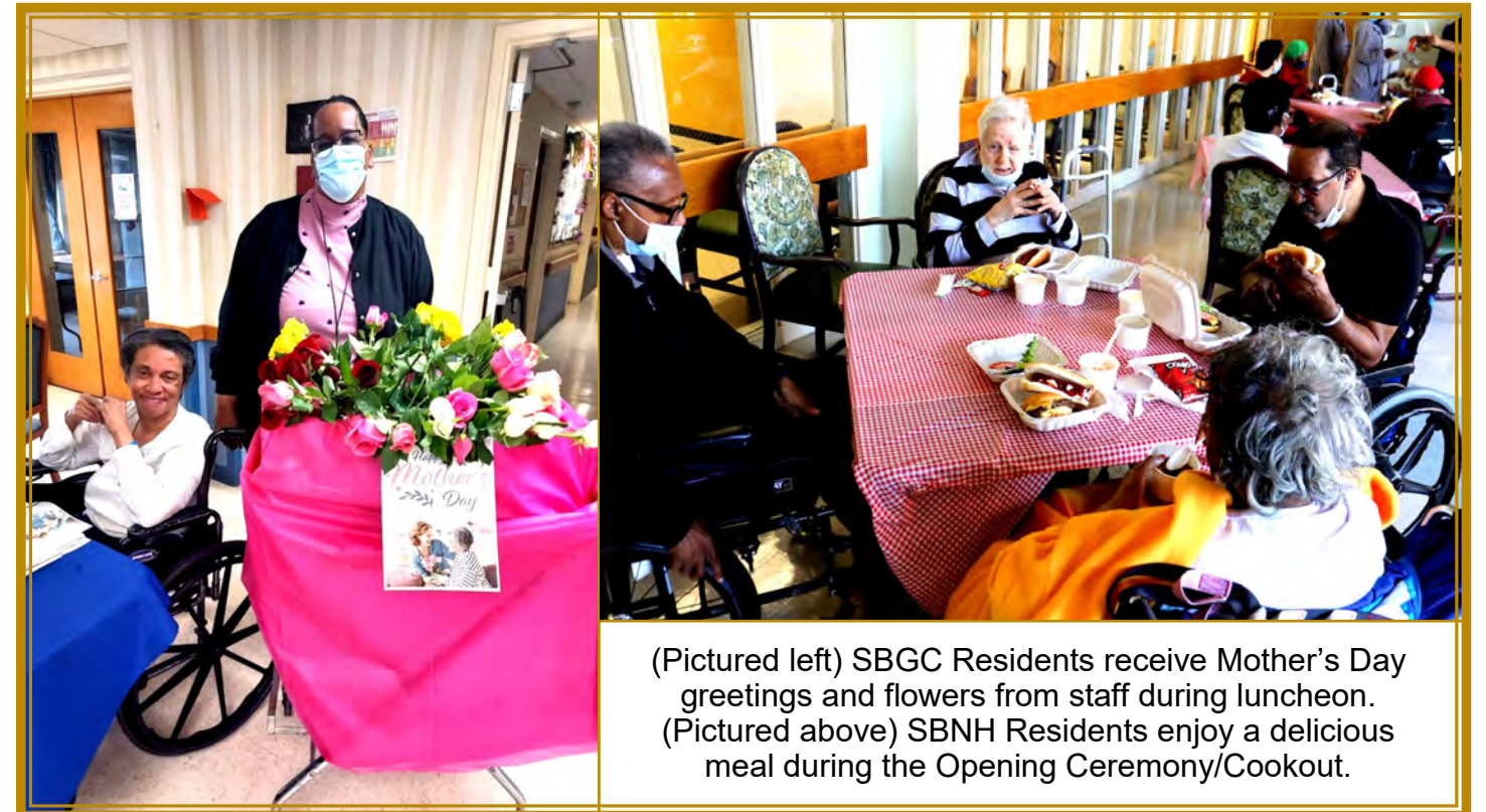
(Pictured left) SBGC Residents receive Mother’s Day greetings and flowers from staff during luncheon. (Pictured above) SBNH Residents enjoy a delicious meal during the Opening Ceremony/Cookout.

The week began on Mother’s Day with a luncheon and delivery of floral arrangements to residents at SBNH and SBGC. Activities throughout the week included an Opening Ceremony/Cookout, Ice Cream Social, Nurses Luncheon and Talent Show. Overall, the week was a wonderful time to honor and celebrate the essential roles of skilled nursing care centers and staff in caring for our elders.