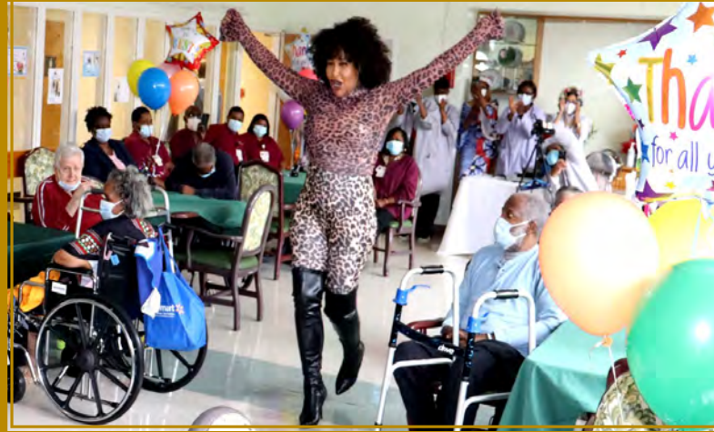
Staff Fashion Show for residents' joy and delight.