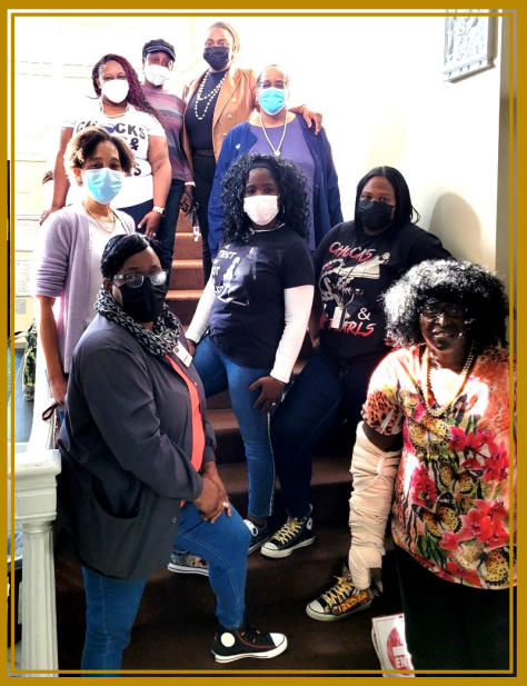
Staff celebrated “ Chucks and Pearls Day ” in honor of Vice President Kamala Harris.