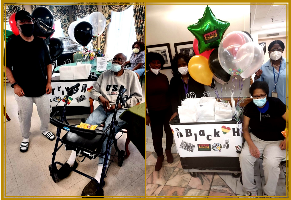
Residents participated in Black History Trivia and were honored with prizes for all correct answers.