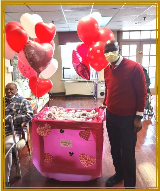
Residents received love and cupcakes on Valentine's Day .

Instituting innovative and engaging support services that will help people thrive in their place of community