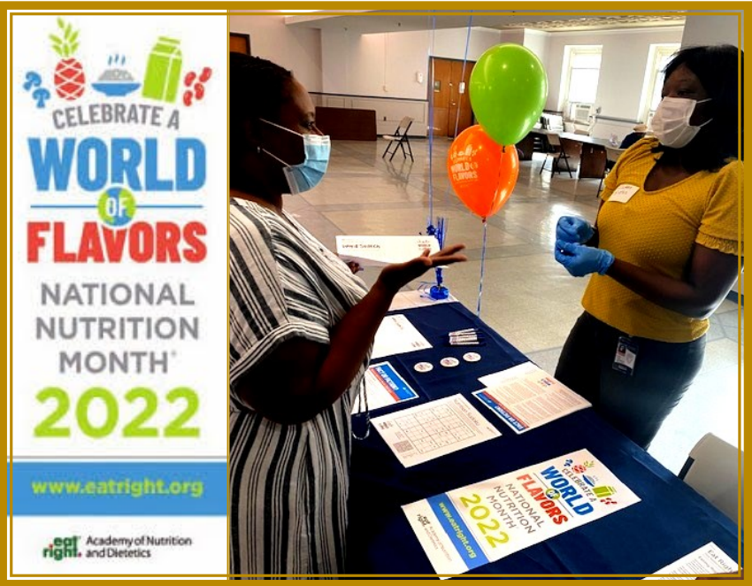
March is recognized as “ National Nutrition Month ”. Staff received information for developing healthy eating habits.