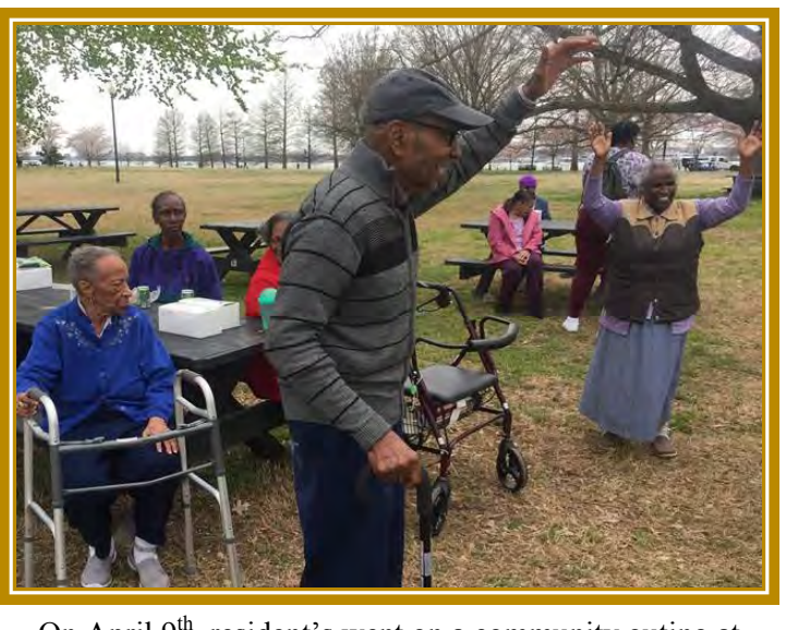
On April 9<sup>th</sup>, resident's went on a community outing at Haines Point for lunch, good time of fun and laughter.