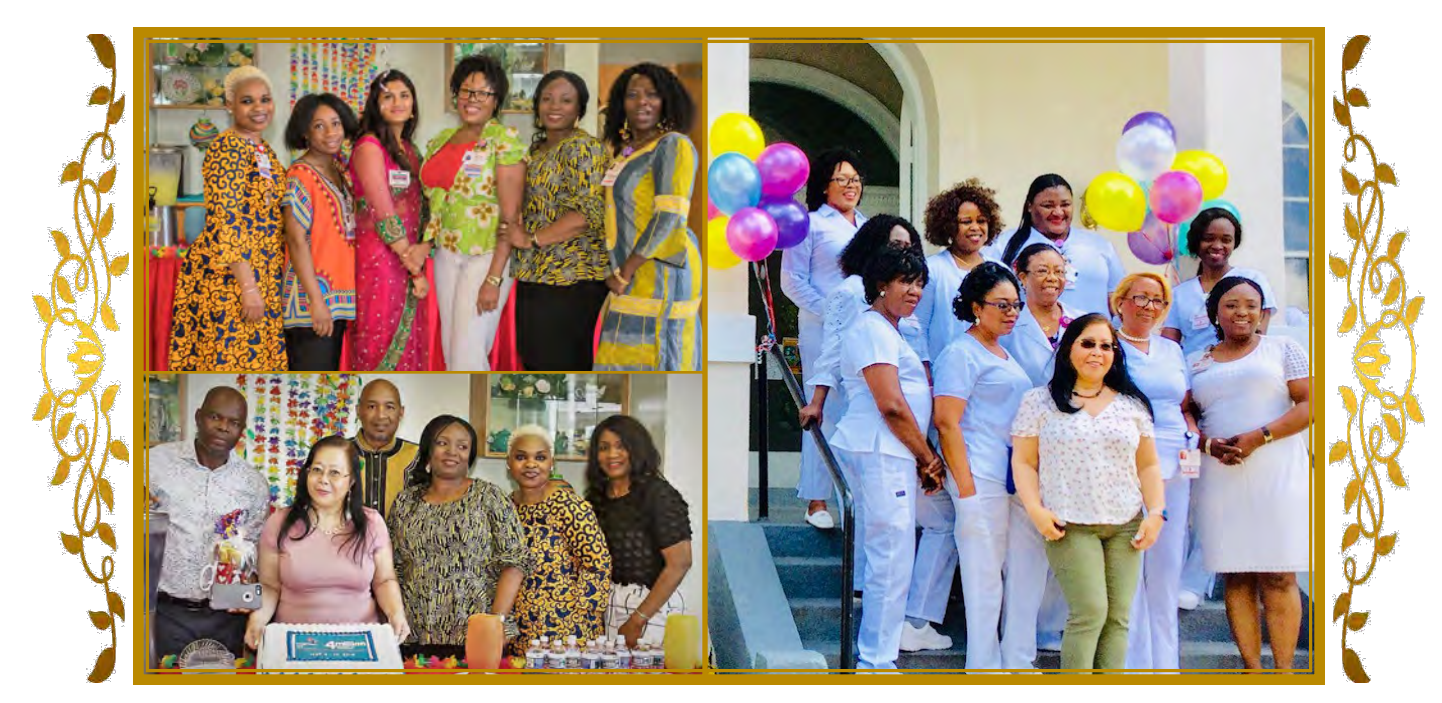
Stoddard recognized and celebrated the nursing staff during "National Nurses Week", which was observed May 6th - 12th.