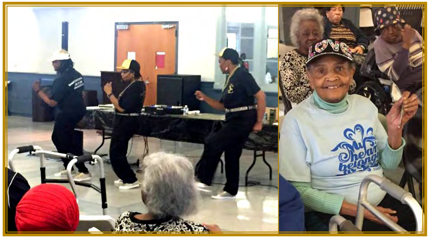
Smooth Entertainment (Residents love the progam) lots of laughs, good times and an awesome atmosphere.

"National Nurses Week" is celebrated with food, music and lots of fun.