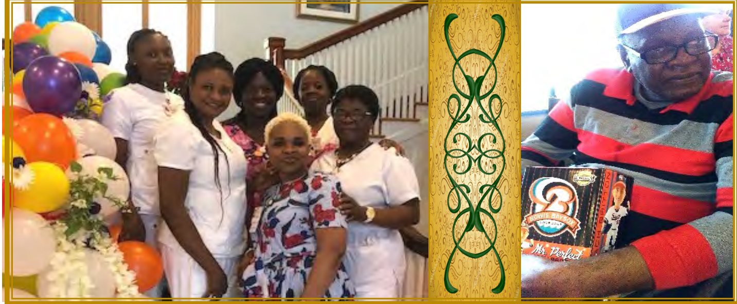
"National Nursing Assistants Week" was celebrated and honored nursing assistants during June 13th - 20th.