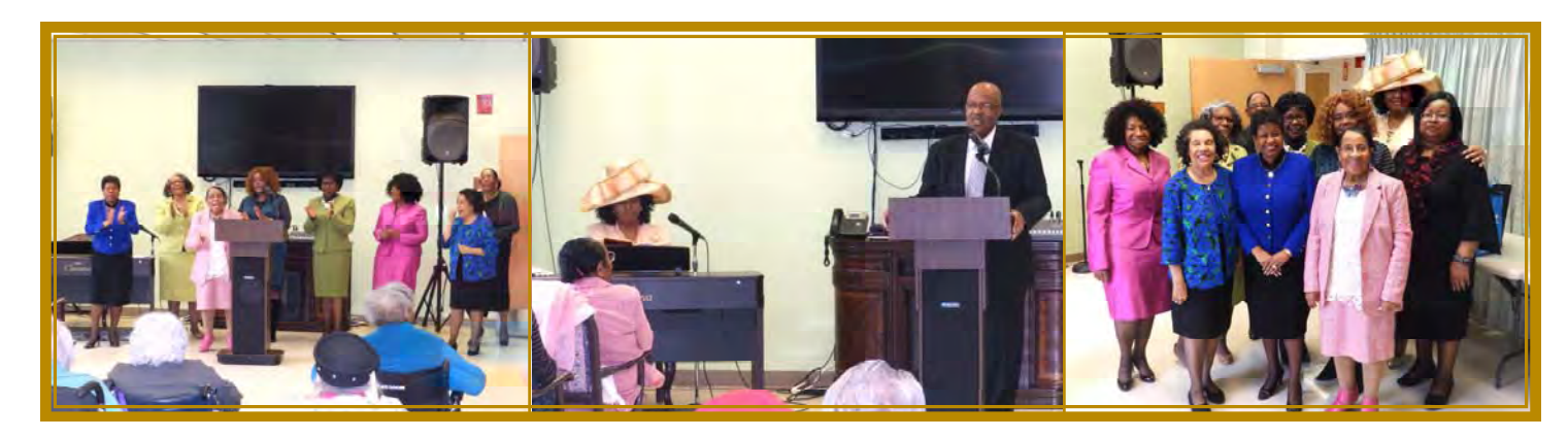
Baptist Ministers' Wives hosted an Easter Monday Program