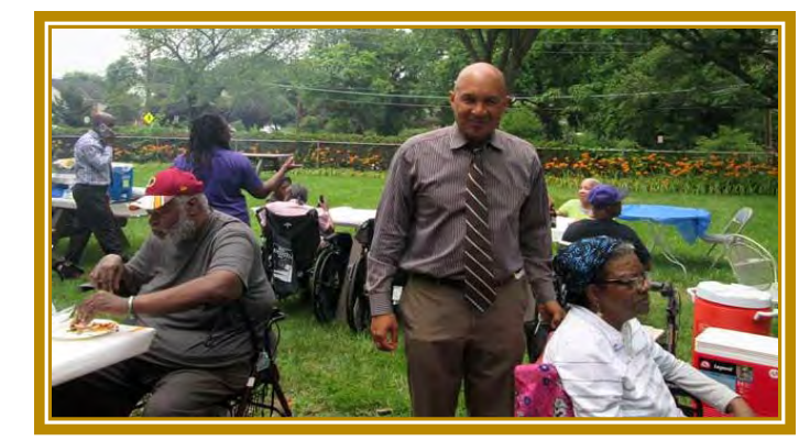
"Chilling with the Fellas" Cookout