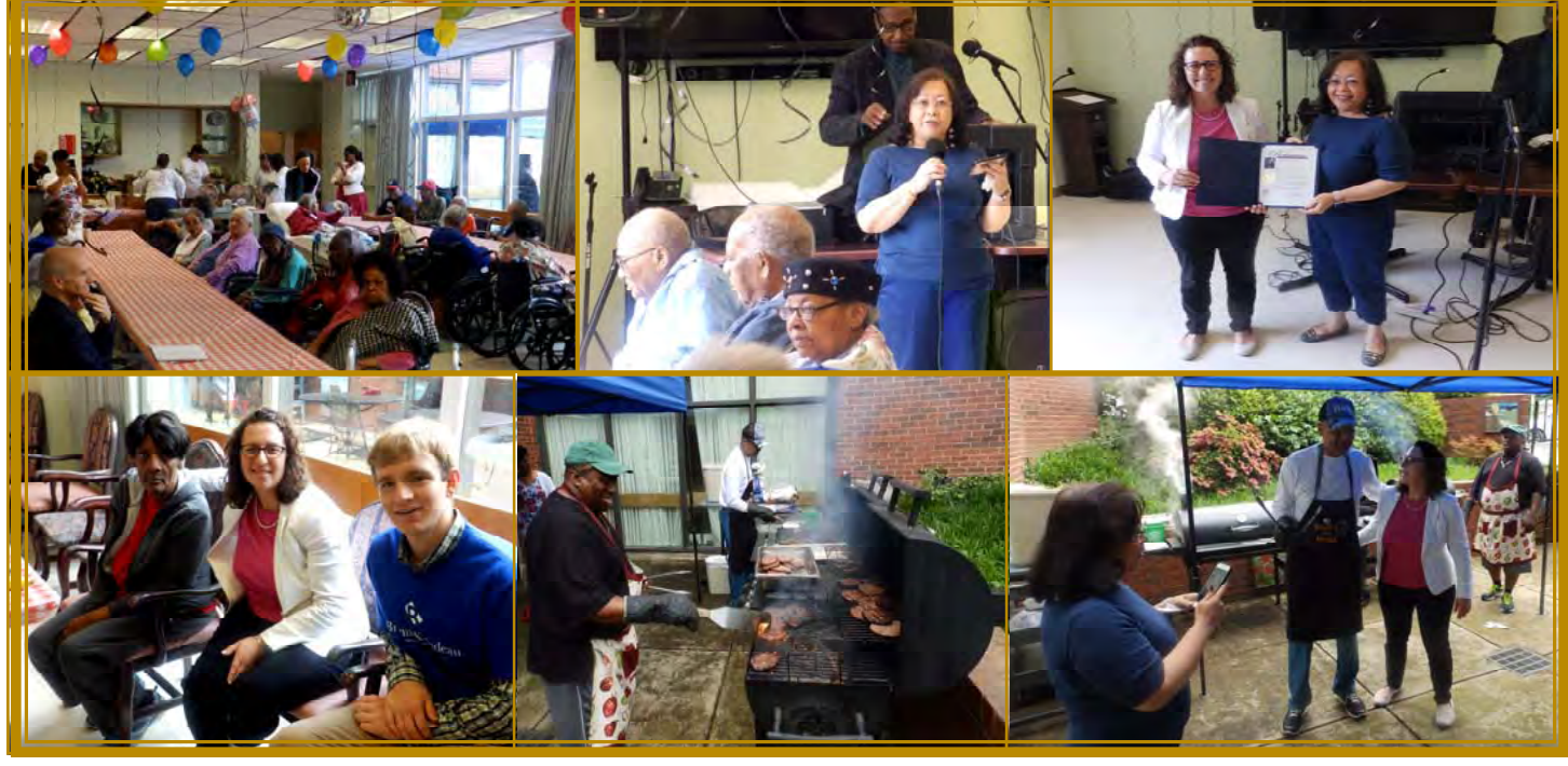
Opening Ceremony of "National Skilled Nursing Care Week" - May 13th - 19th