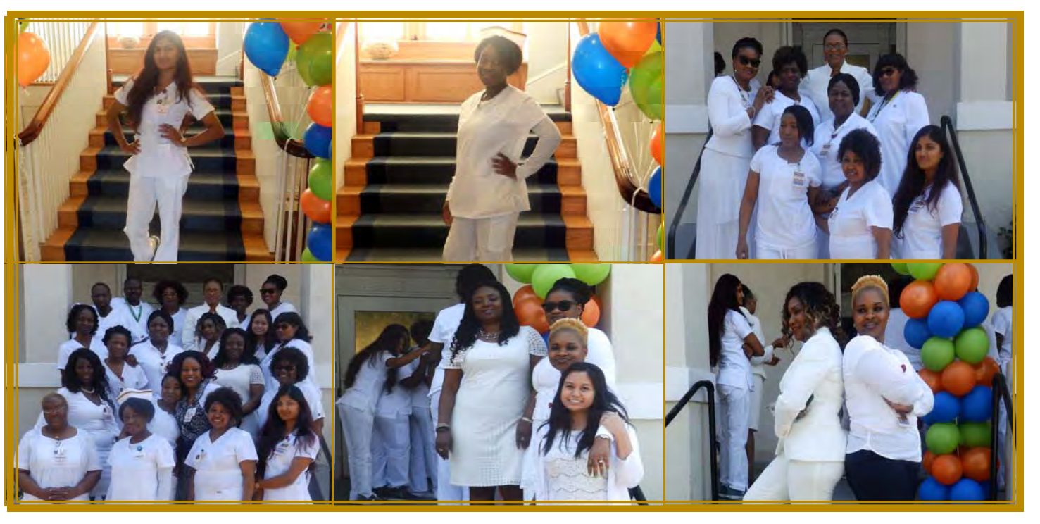
"National Nurses Week" - May 6th - 12th