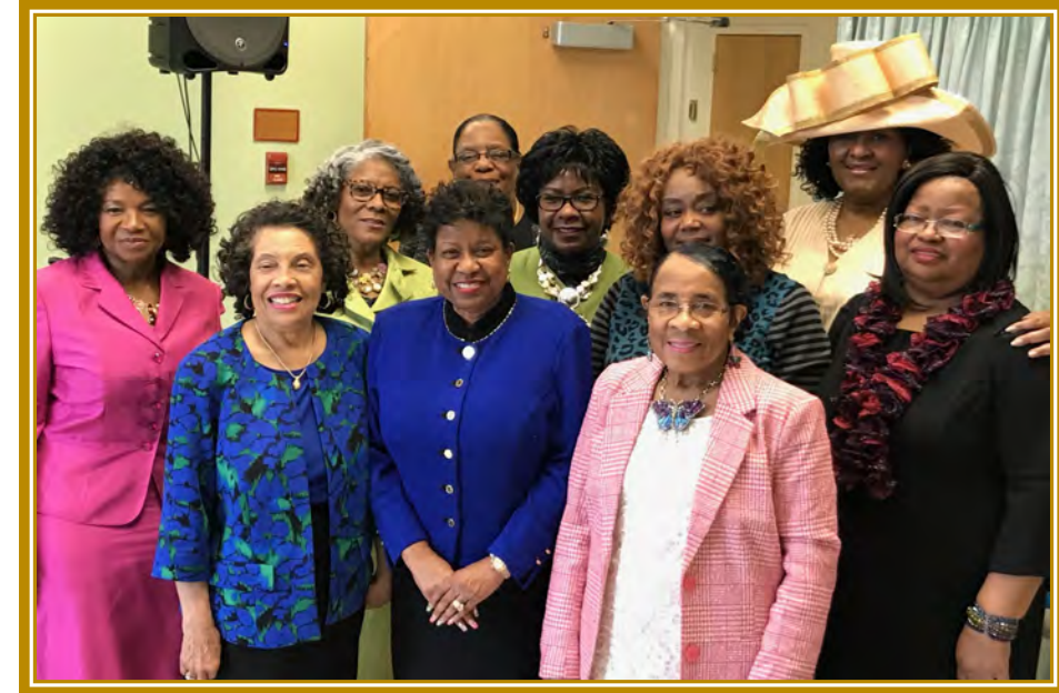
The Baptist Ministers' Wives and Widows Association of Washington, D.C. and Vicinity hosted a Easter Monday Program for residents at Stoddard Baptist Nursing Home.