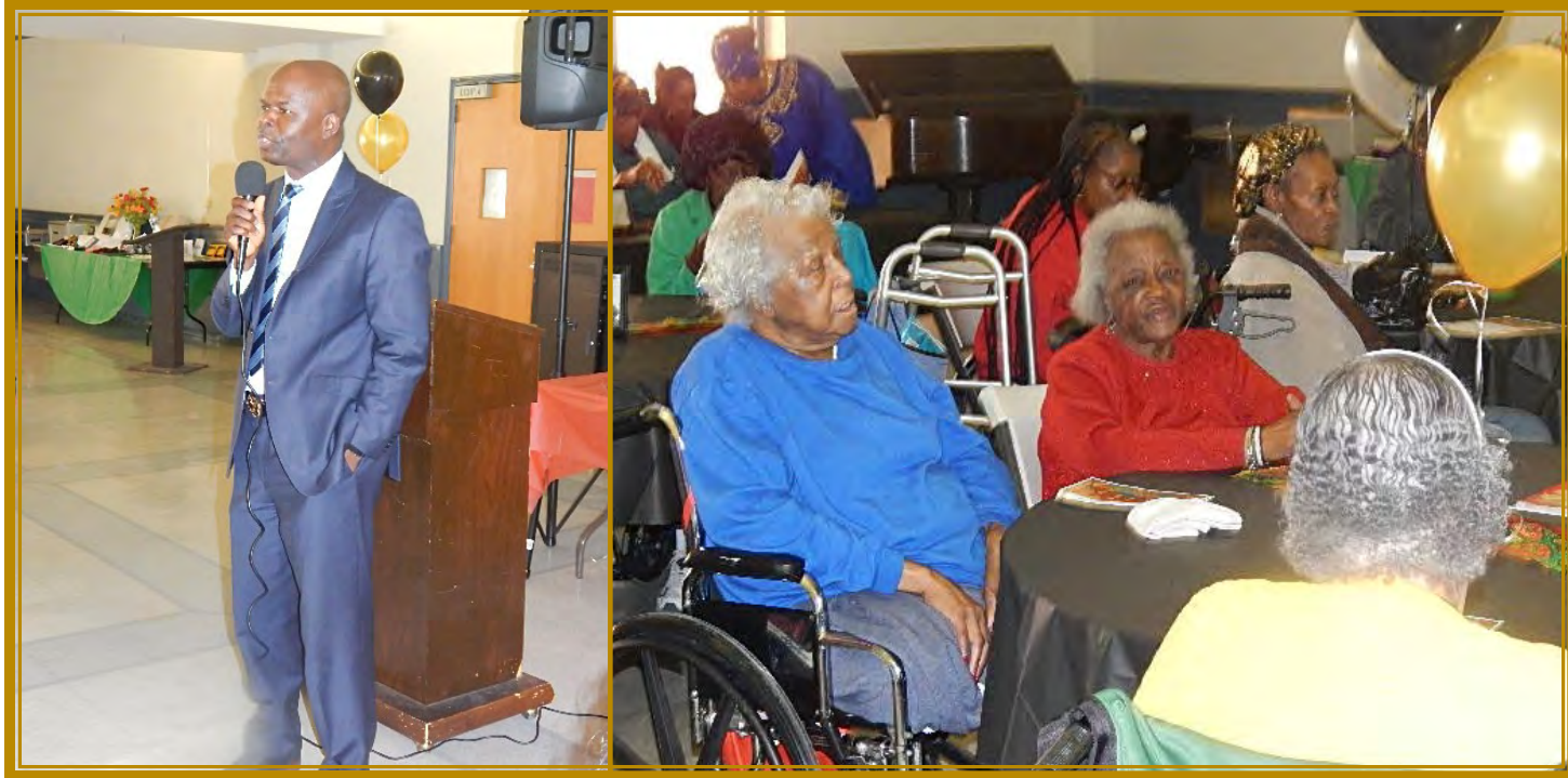
Black History Month Program