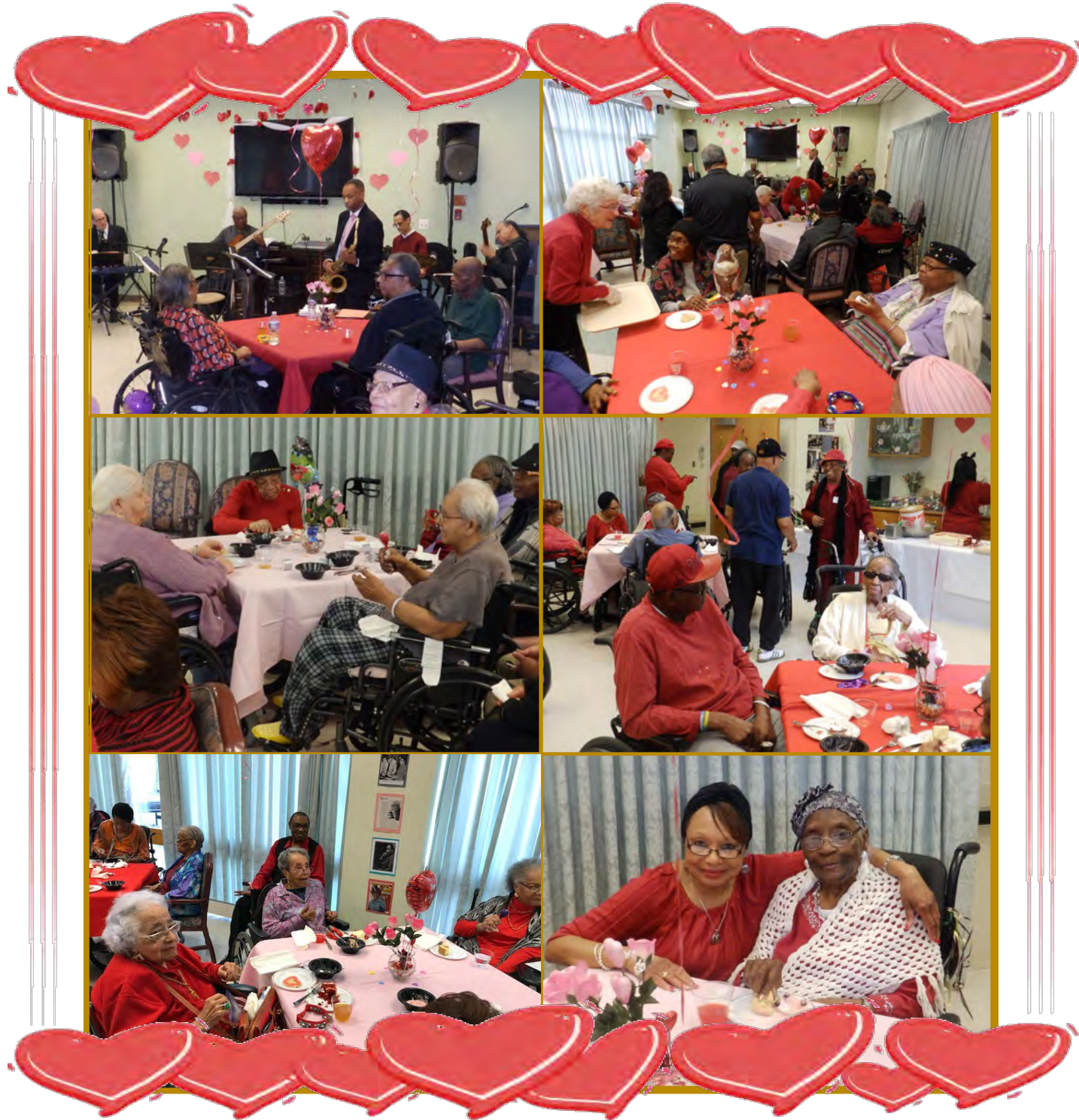
SBNH residents enjoy a Valentine's Day celebration and concert.