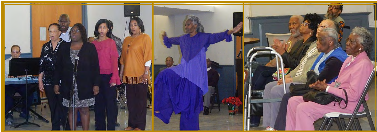
Gospel Festival of Praise