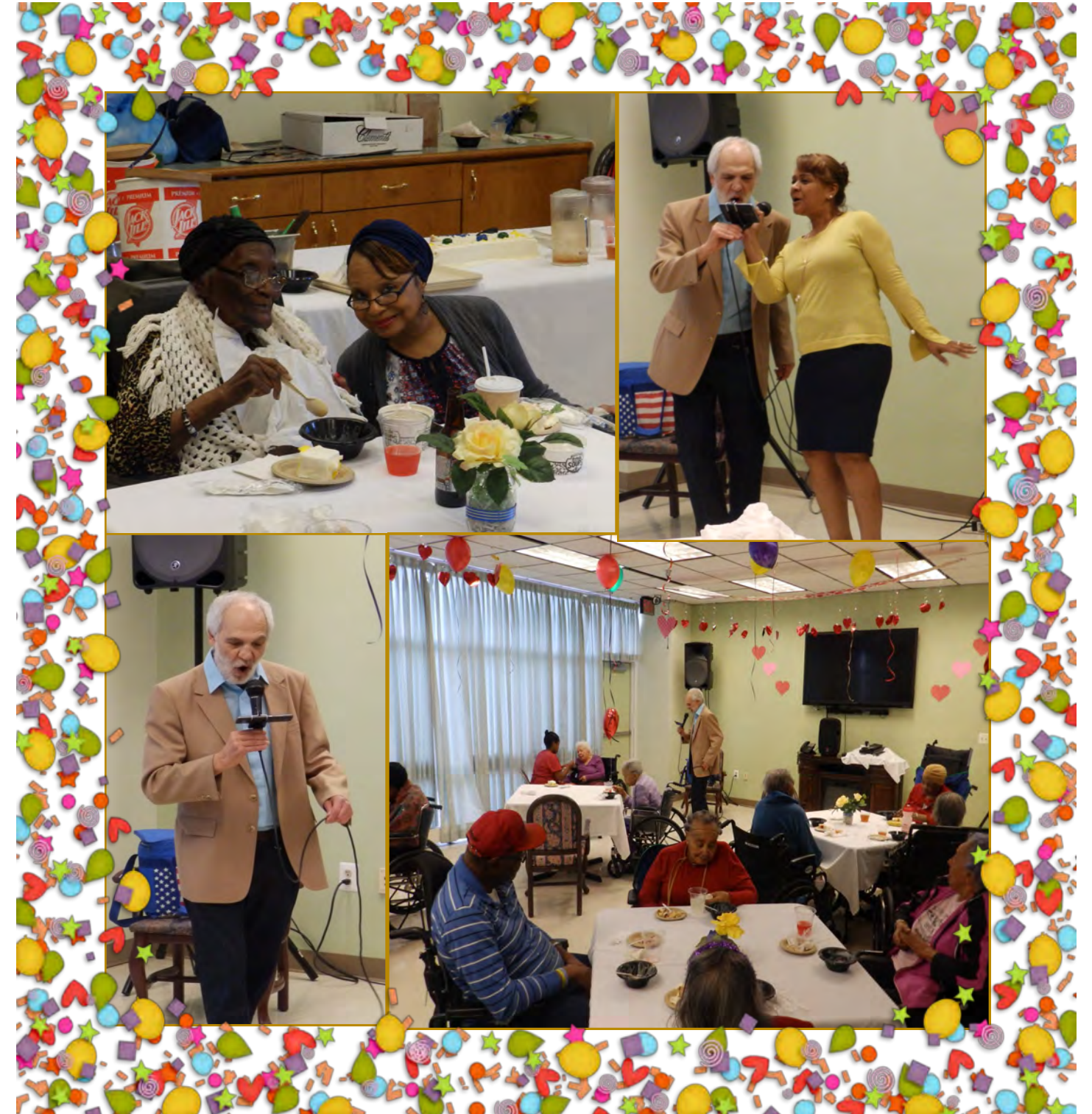
SBNH residents celebrate monthly birthday party.