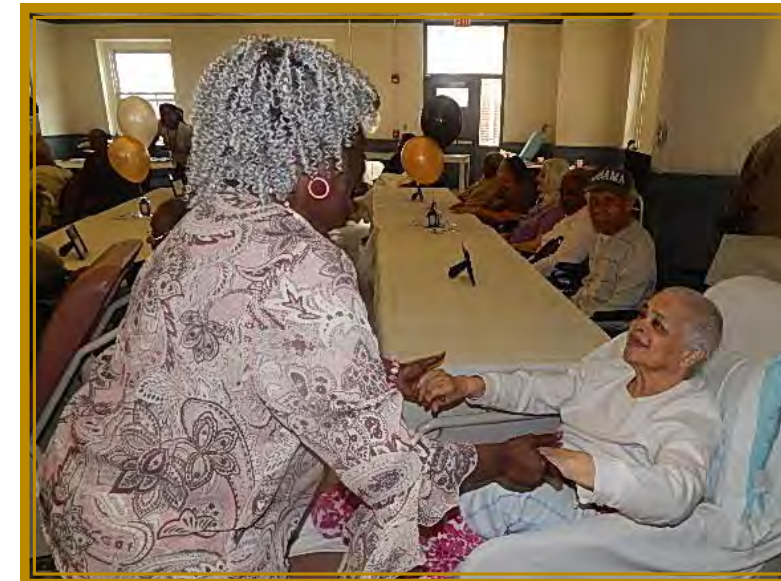
Oh yes!! They're playing my song!