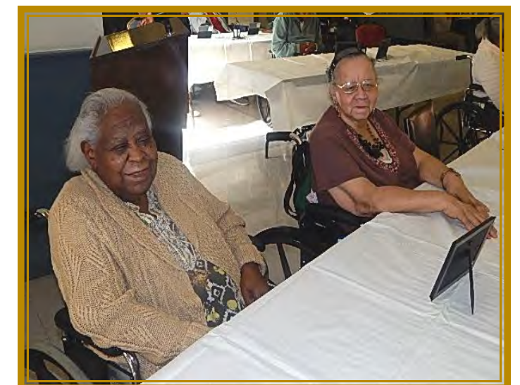
Thanks for the memories:-)