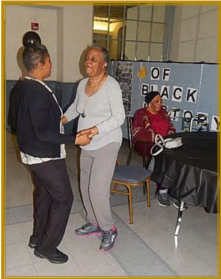
I may be blind, but I can still “cut a rug”!