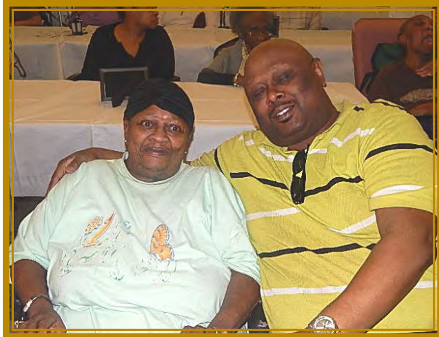
Mother and son having a wonderful time together.