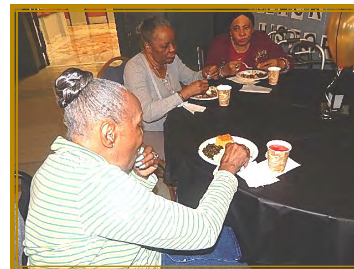
Pigs feet, potato salad, greens and spicy cornbread! Mmmm.... delicious!!