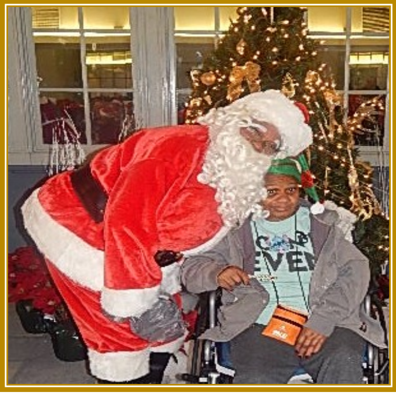
Ladies Club Christmas Party