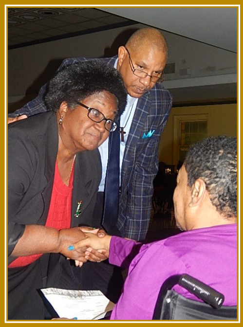
27th Annual Candlelight Reflections

“To form and sustain safe, viable and caring communities for those in need”.