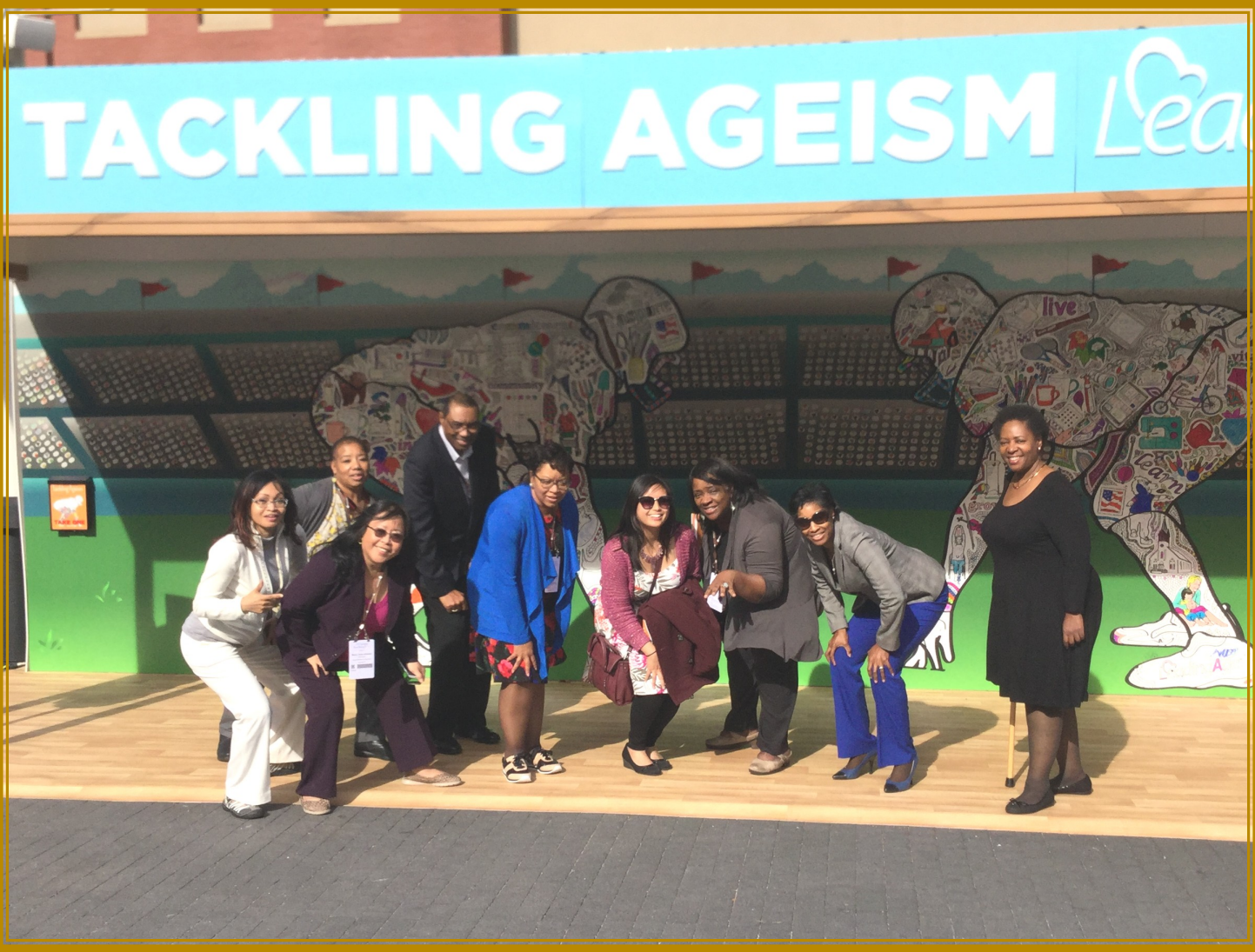
Staff members from SBNH and SBGC attend the LeadingAge National Conference in Indianapolis, Indiana.

“To form and sustain safe, viable and caring communities for those in need”.