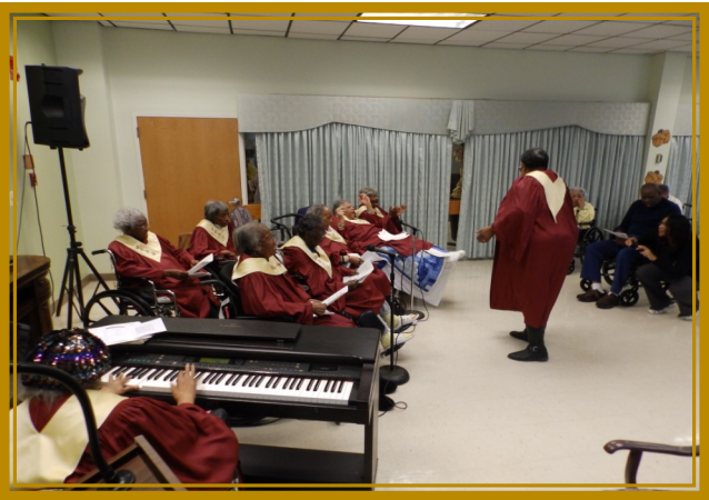
Residents’ Thanksgiving Day Program