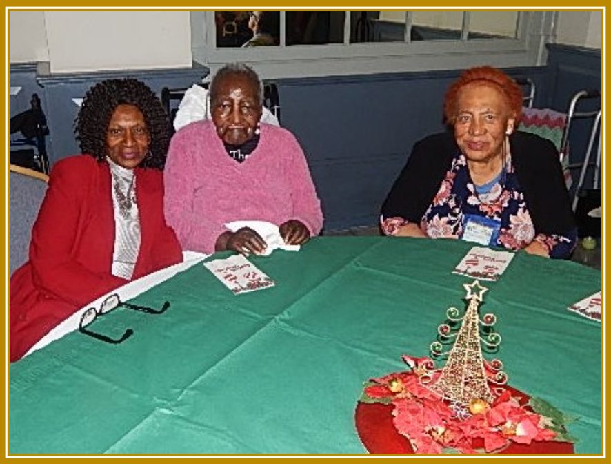
Residents' Christmas Party