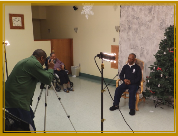
Residents’ Picture Taking Day