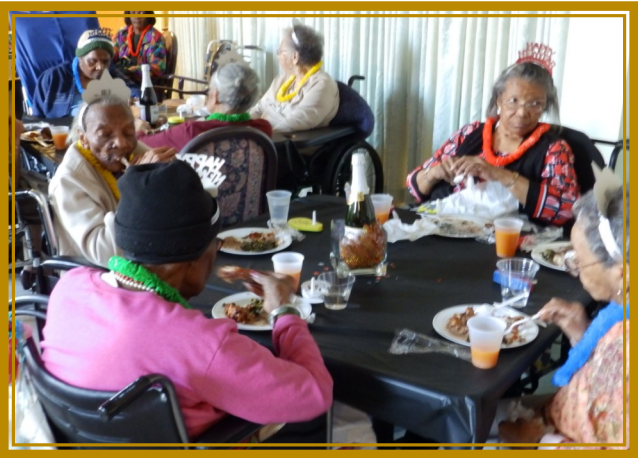
Residents’ New Year Party